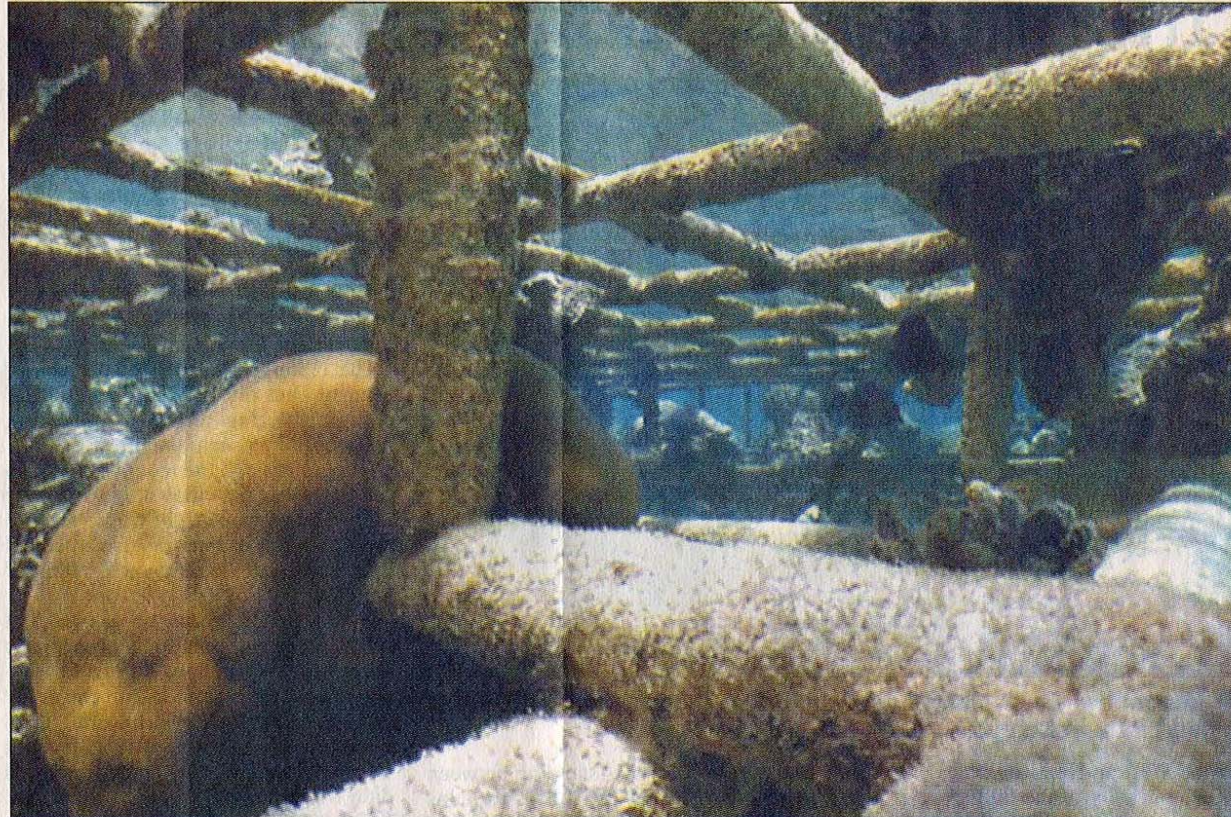
An interior view of large breakwater with massive coral at left, of the Ihuru Necklace in Maldives.